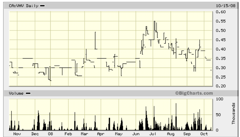
VALLEY HIGH VENTURES (VHV) MARKET CAP $4 MM