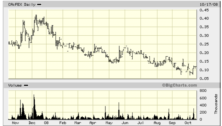
FJORDLAND (FEX) MARKET CAP $7 MM