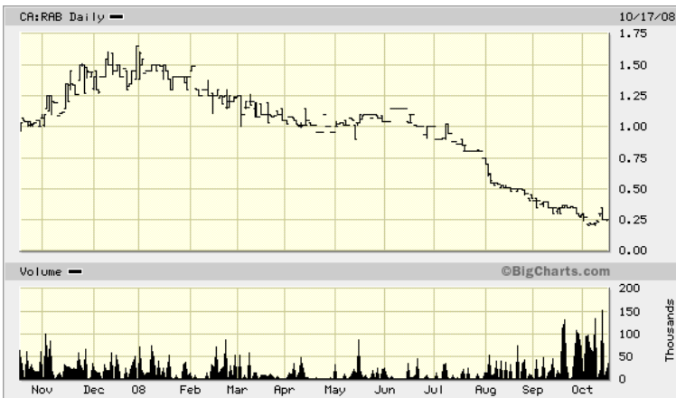
RAMBLER METALS (RAB) MARKET CAP $14.8 MM