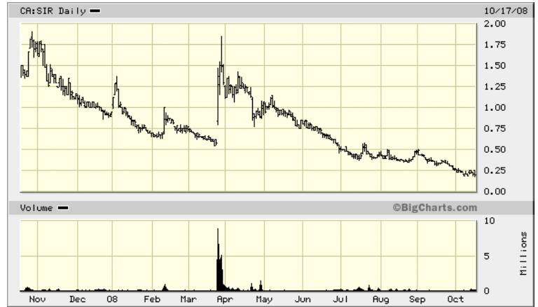
SERENGETI RESOURCES (SIR) MARKET CAP $9 MM