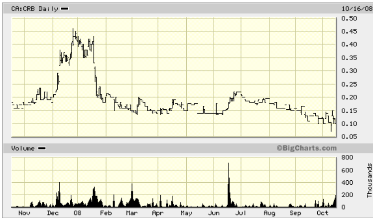
CARIBOO ROSE (CRB) MARKET CAP $2.5 MM