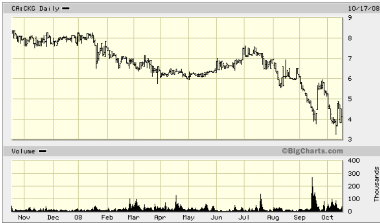
CHESAPEAKE GOLD (CKG) MARKET CAP $120 MM