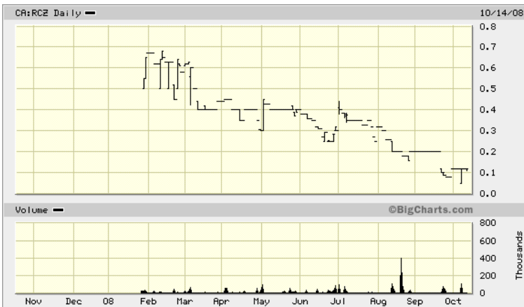
RIO CRISTAL (RCZ) MARKET CAP $1.4 MM