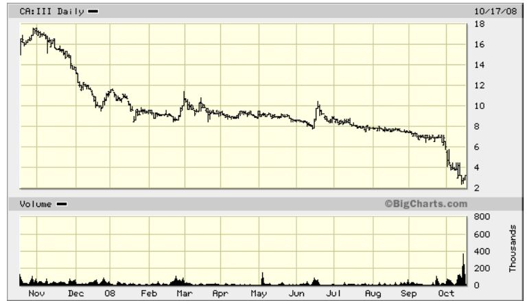
IMPERIAL METALS (III) MARKET CAP $106 MM