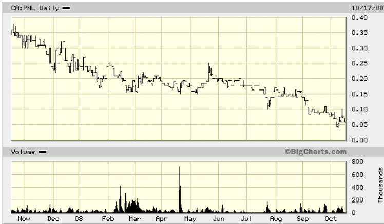
PINNACLE MINES(PNL) MARKET CAP $2.6 MM