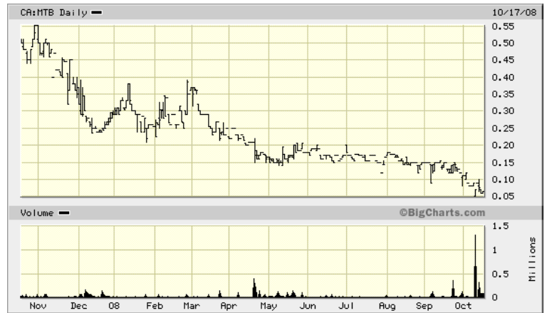
MOUNTAIN BOY (MTB) MARKET CAP $2.2 MM