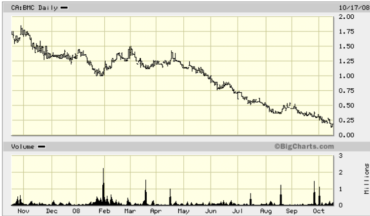
BRILLIANT MINING (BMC) MARKET CAP $13.5 MM