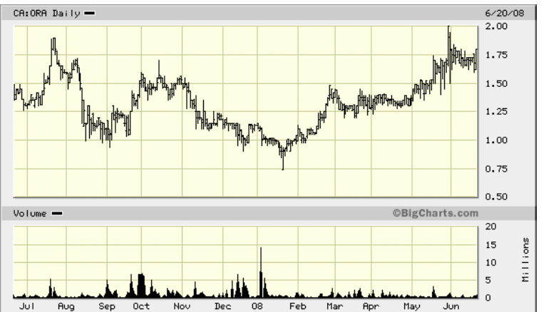
AURA MINERALS (ORA) – MARKET CAP $986 MM