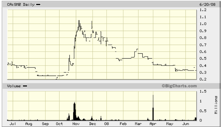
SINCHAO METALS (SMZ) – MARKET CAP $11 MM