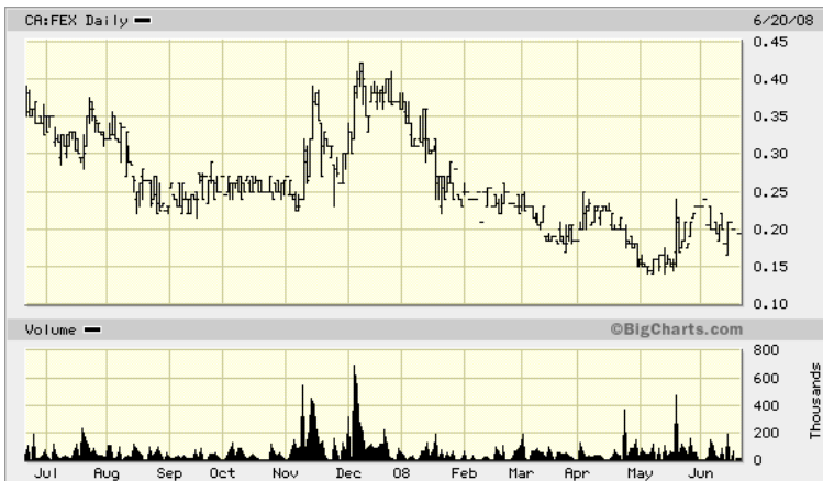
FJORDLAND (FEX) – MARKET CAP $10 MM