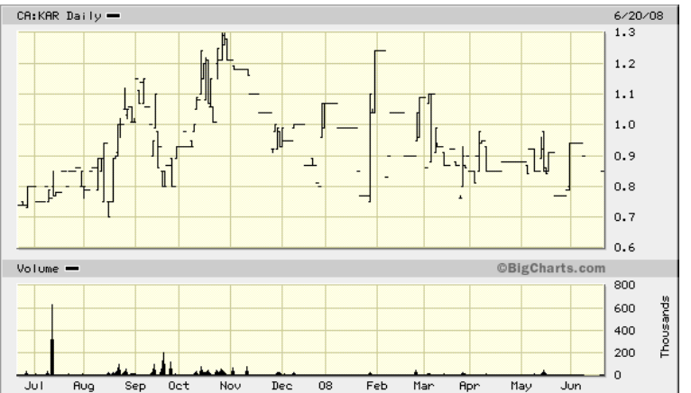
KARMIN EXPLORATION (KAR) – MARKET CAP $32 MM