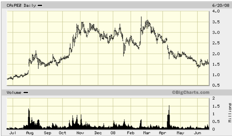
PEDIMENT (PEZ) – MARKET CAP $61 MM