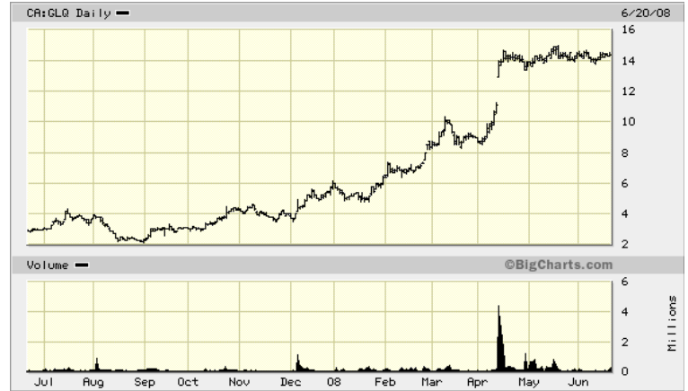
GLOBAL COPPER (GLQ) – MARKET CAP $475 MM