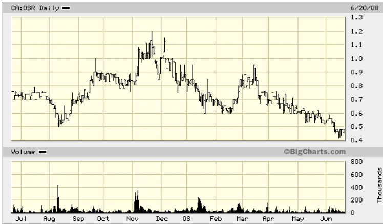
ORO SILVER (OSR) – MARKET CAP $12 MM