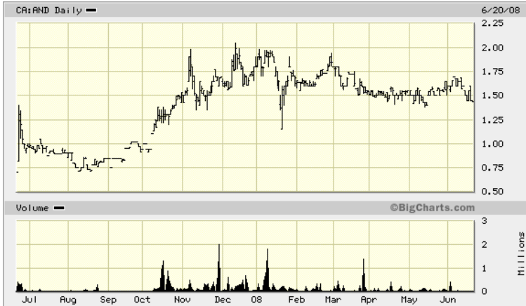
ANDINA MINERALS (AND) – MARKET CAP $528 MM