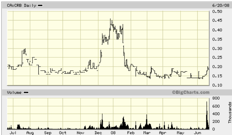
CARIBOO ROSE (CRB) – MARKET CAP $4.5 MM